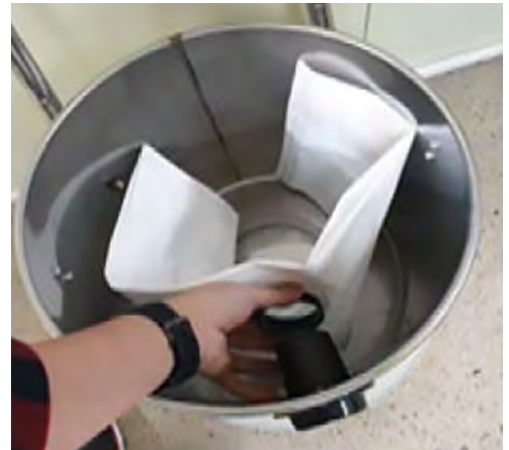
Containment Bag for Wet or Dry

CV150C includes both Pre-Filter for Dry and Containment Bag for Wet/Dry