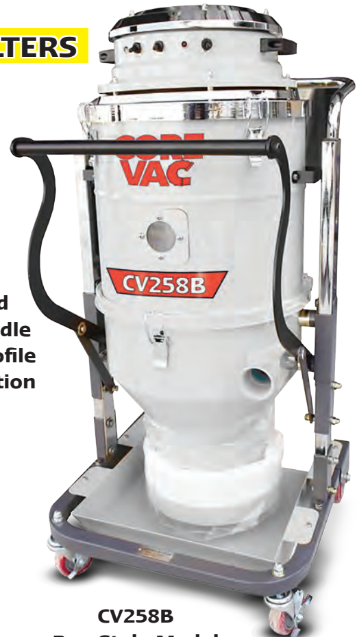
CV258B Bag Style Model

Raise and Lower Handle for Low Profile Transportation