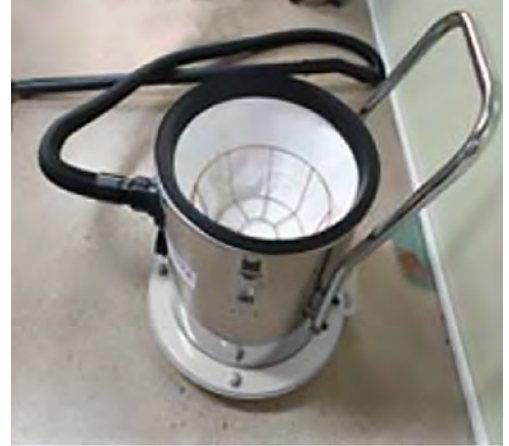
Pre-Filter for Dry Containment