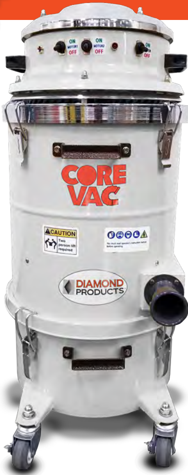
CV258C Can Style Model