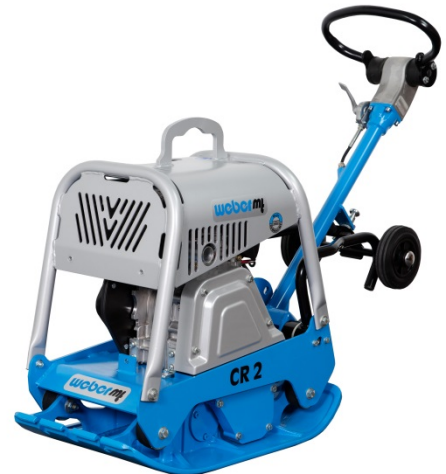
Fig. with water sprinkler system. CR 2