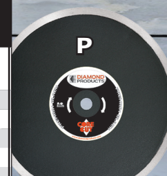
Premium Black • Highest quality diamond and longest cutting life

T17- Fast, smooth cut in granite, marble, glass, porcelain and other hard, dense tiles.