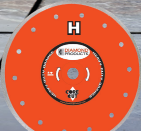
Heavy Duty Orange • Very high quality diamond and longer cutting life

*Denotes 7/8" arbor with 5/8" bushing. **Denotes diamond arbor with 5/8" (removable) bushing Tile blade for use on tile or circular saws