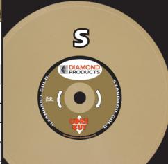
Standard Gold • Better quality diamond and better cutting value