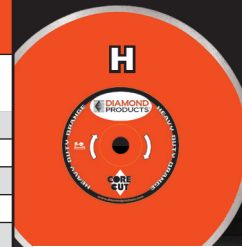
Heavy Duty Orange • Very high quality diamond and longer cutting life