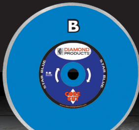
Star Blue • Good quality diamond and good cutting value