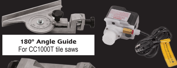
180° Angle Guide For CC1000T tile saws