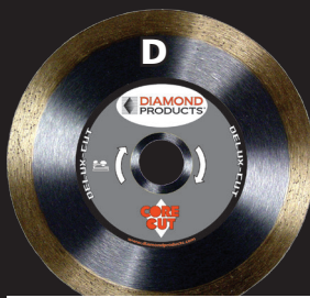
Delux-Cut • Basic quality diamond and economical cutting value