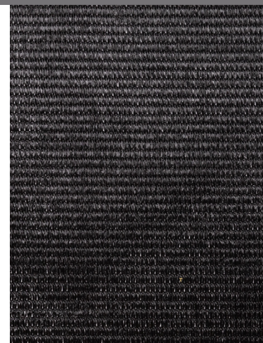
Privacy Fence Sample