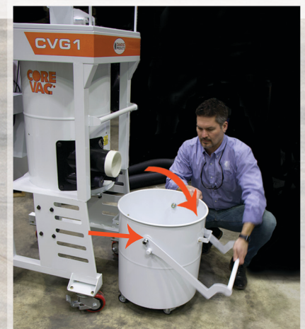
Quick release drum for fast removal.

With Our First-Cut System All testing has done in a controlled environment using an air velocity meter and a mechanical gauge measured at the neck of each vacuum. These figures should be used as a reference only..